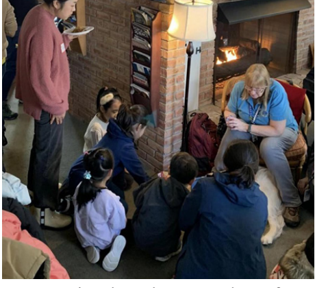
Internationals gather around comfort dog following school shooting

We were in unchartered territory here, even with the pandemic so fresh in our collective memories. Our community members went silent. They didn't come to the Friendship House