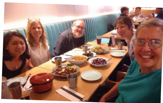
The board enjoyed a delicious Sichuan (Chinese) meal together.