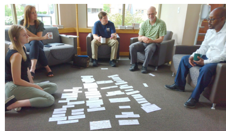
The Campus Ministry team at CSP brainstorms what ministry among internationals might look like and what their next steps are.