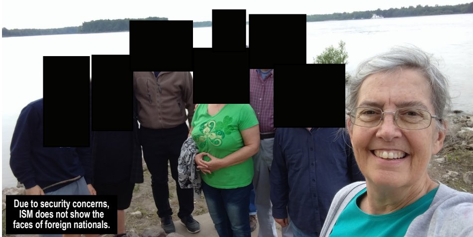
At the junction of the Mississippi and Missouri Rivers