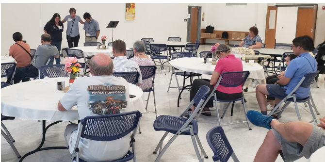
People from each ISM site had the opportunity to share about what God has been doing, then others prayed for them.