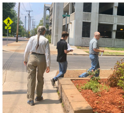
Equipping Conference participants prayed for the international students living in apartments across the street during an after-lunch prayer walk.