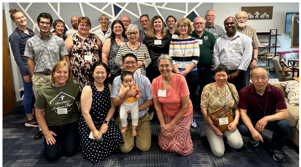
What a blessing to learn and grow together during the Equipping Conference 2023