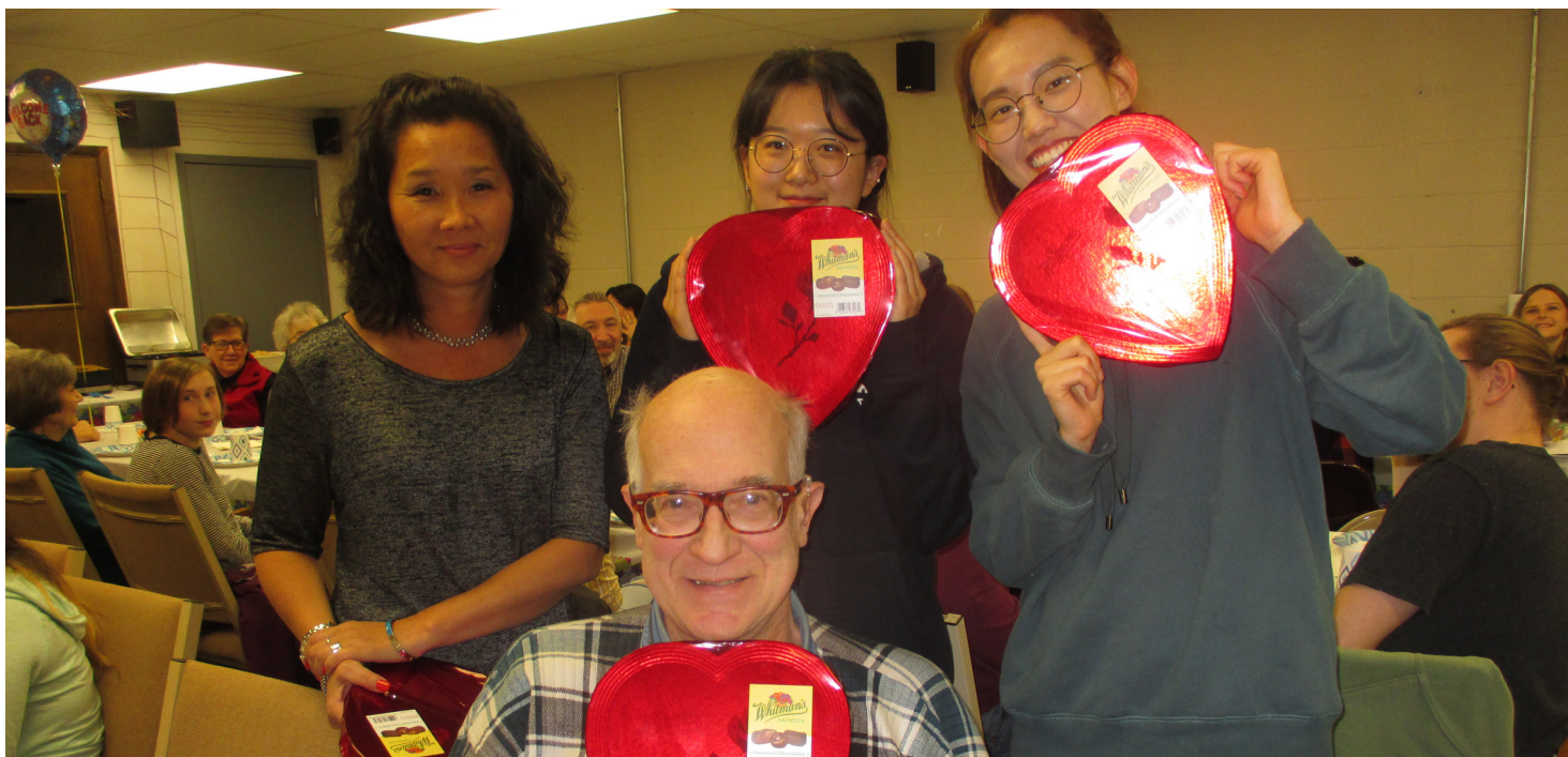
INTERNATIONAL STUDENTS ENJOYING A VALENTINE'S DAY DINNER