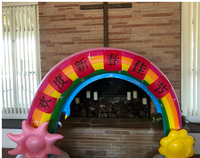
A rainbow welcomed guests to the Chinese New Year event and provided another connection to God’s promises

Thank you to all who made this event possible. †