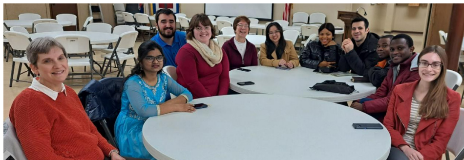
American and International Students share a “Welcome Back” meal with volunteers