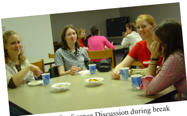
Equipping Conference Discussion during break

Praise God with us for each of these faithful servants and the blessings they have been and will continue to be to our sites and to international students and scholars. †