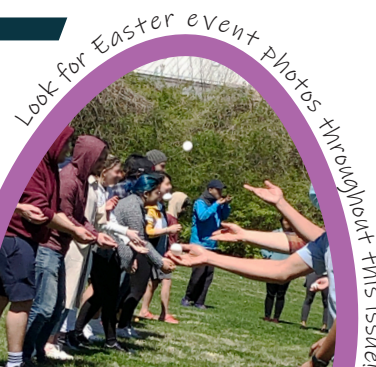
Look for Easter event photos throughout this issue!

the donation process for ISM, Inc., and especially thankful for all who are part of this amazing ministry.